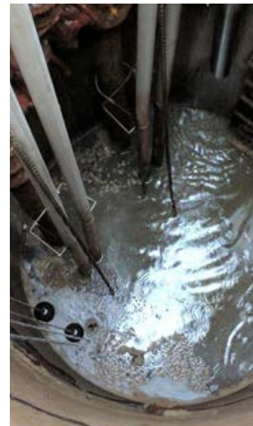
After two weeks of using biological treatment