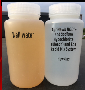
Before and after treatment:

is a highly-effective disinfectant and pH modifier. It's a safe, dependable way to disinfect poultry drinking water.