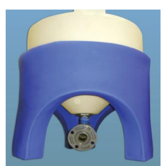
8" Diameter Cone Tip Flat can accommodate up to a 3" fitting